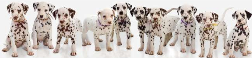
We Are Family